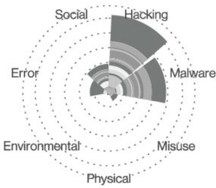
Figure 64. Individual contributors per action