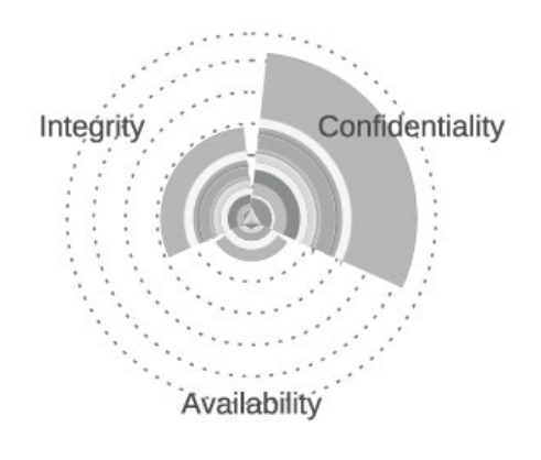
Figure 67. Individual contributors per attribute

The first type of bias is random bias introduced by sampling. This year, our maximum confidence is +/- 0.7% for incidents and +/- 1.4% for breaches, which is related to our sample size. Any subset with a smaller sample size is going to have a wider confidence margin. We've expressed this confidence in the complementary cumulative density (slanted) bar charts, hypothetical outcome plot (spaghetti) line charts and quantile dot plots.